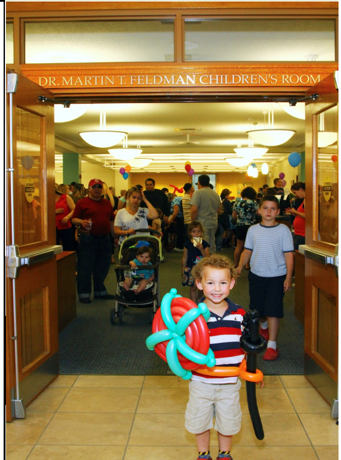
The Dr. Martin T. Feldman Children's Room presented 279 programs attended by 11,651 children and their caregivers